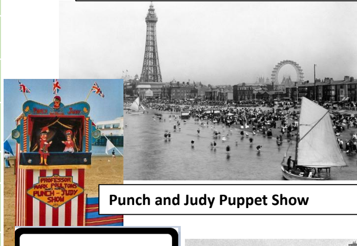
Punch and Judy Puppet Show