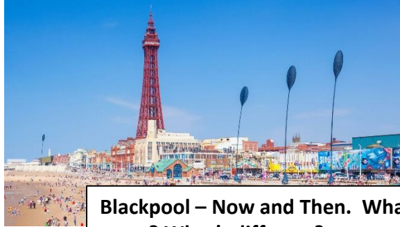
Blackpool – Now and Then. What's the same? What's different?