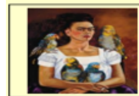
My parrots by Frida Kahlo